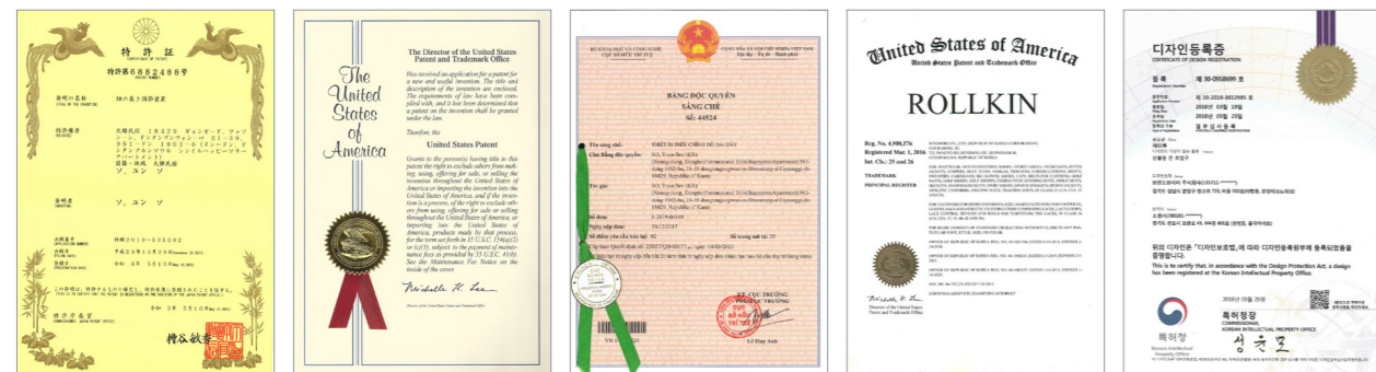
PATENT JAPAN RK 6.0 PATENT USA RK 3.0 PATENT VIETNAM RK 6.0 USA ROLLKIN TRADE MARK Certificate of Design Registration (Republic of Korea)