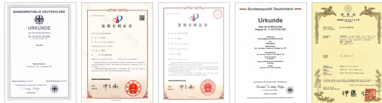
GERMAN ROLLKIN TRADEMARK PATENT CHINA RK 6.0 PATENT CHINA RK 3.0 PATENT GERMANY RK 3.0 PATENT JAPAN RK 3.0