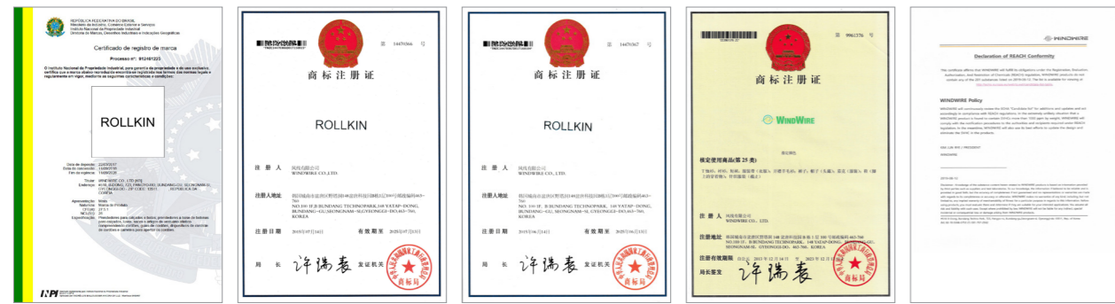
BRAZIL ROLLKIN TRADE MARK CHINA ROLLKIN TRADEMARK 26CLASS CHINA ROLLKIN TRADEMARK 25CLASS CHINA WINDWIRE TRADEMARK Declaration of REACH Conformity (REACH Declaration)