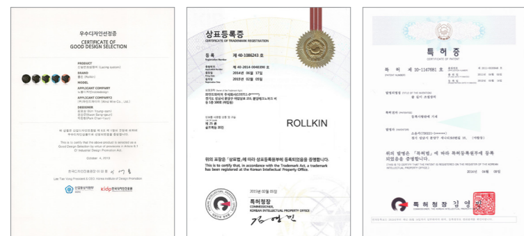
Good Design Award Selection Certificate (ROLKIN) Certificate of Trademark Registration - ROLKIN (Republic of Korea) Patent Certificate (Republic of Korea)